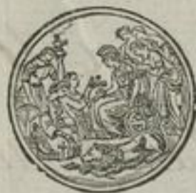
Prize Medal awarded for Geological Collections.