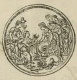
Prize Medal awarded for Geological Collections.