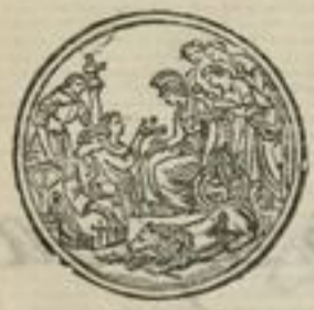
Prize Medal awarded for Geological Collections.